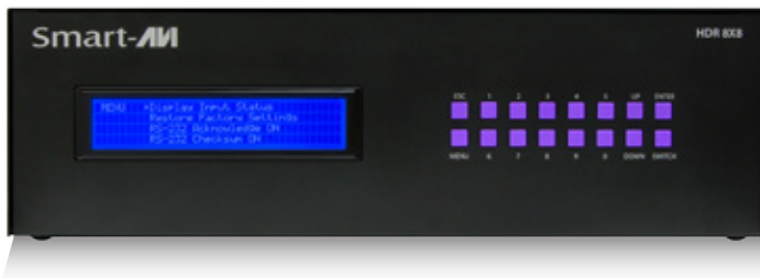
HDR 8X8 Front