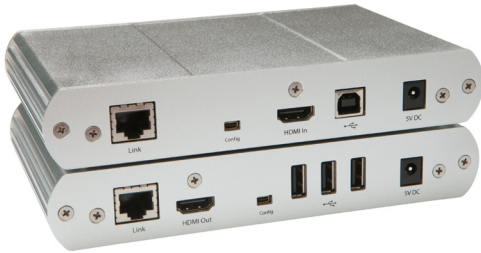
Rear view of LEX (top) and REX (bottom)