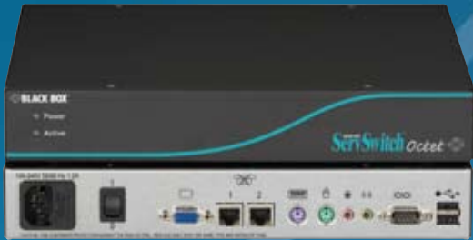
KV1713A: top: front view; bottom: rear view

And power consolidation is an option, too. To provide power for up to four serial RS-232/V.24 (KV1724A) SAMs, order a power supply (PS123A).